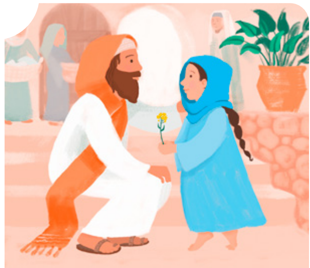
Think about Jesus and promise to always remember Him.

The sacrament helps us feel the Holy Ghost. It helps us stay on the path back to our heavenly home. ●