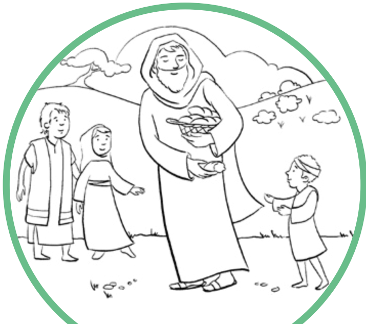
Think of a story about Jesus.