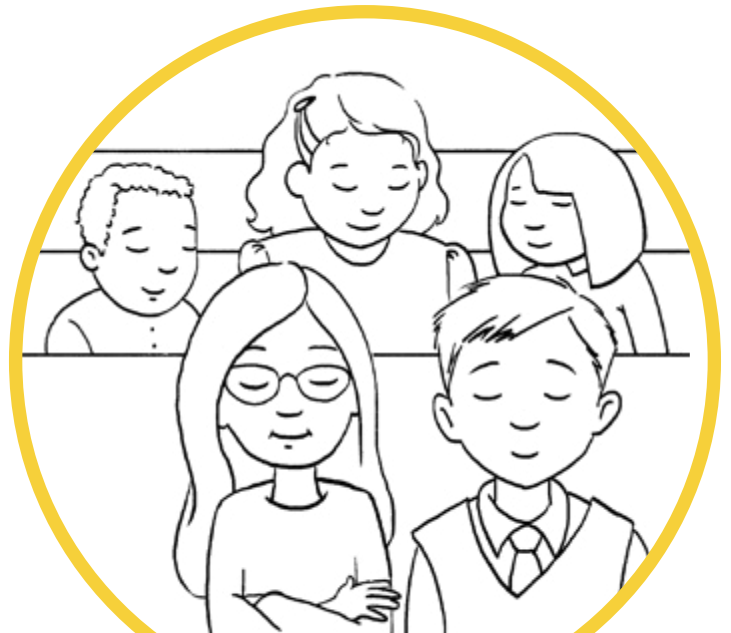
Pray to Heavenly Father.