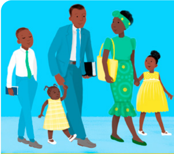
Dress to show we honor the sacrament.