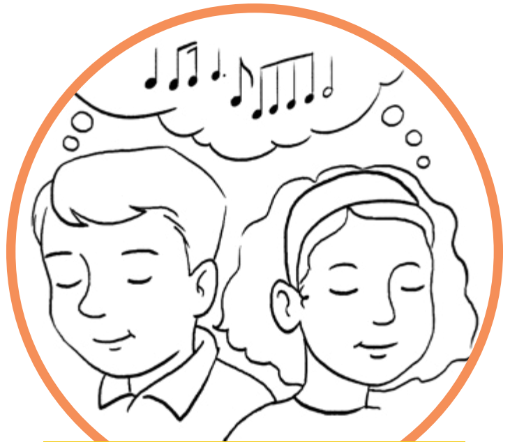
Think of my favorite sacrament hymn.