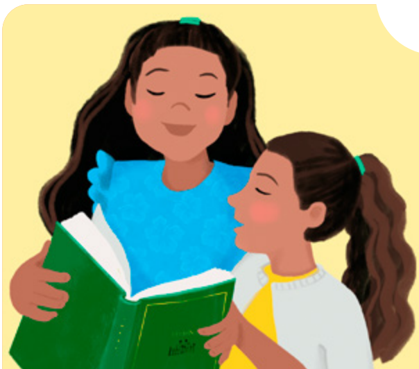
Sing the sacrament hymn.