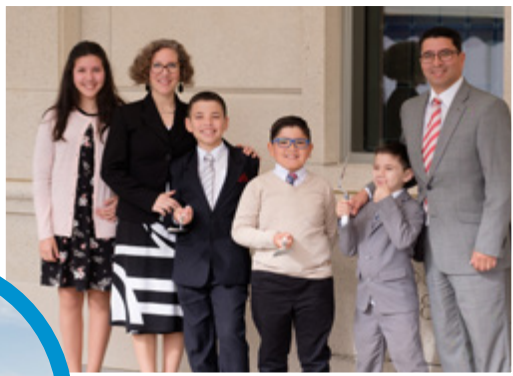
Children came with their parents to hear President Nelson give a special prayer to dedicate the temple.