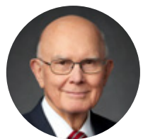
By President Dallin H. Oaks First Counselor in the First Presidency