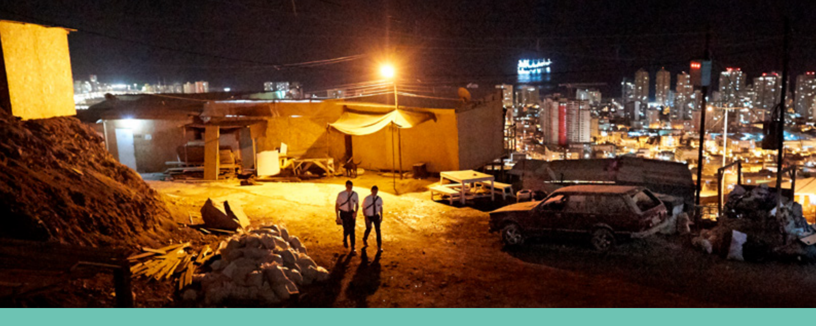
"He's always sharing his own personal experiences—like the way he felt when he went to church for the

person, knowing that I was going to follow Jesus Christ and do my best to keep His commandments."