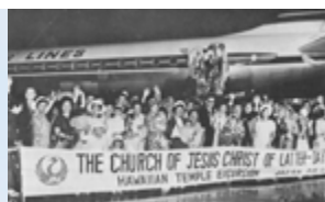
1965: For the first Asian temple excursion, 165 Japanese Saints arrive in Hawaii.