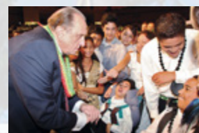
November 21, 2010: Following seismic upgrades and remodeling, President Thomas S. Monson rededicates the temple.