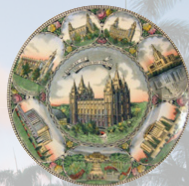
A decorative plate featuring the first eight temples of the Church. Laie is bottom center.