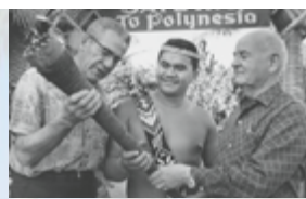
June 13, 1978: President Spencer W. Kimball rededicates the temple after significant expansion. He and President N. Eldon Tanner (above) also visit the Polynesian Cultural Center.