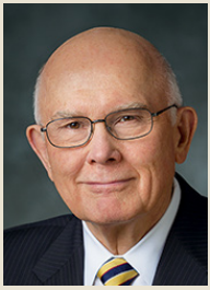
By Elder Dallin H. Oaks Of the Quorum of the Twelve Apostles