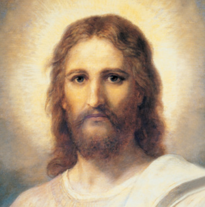
According to the merciful plan of the Father, the effects of the Fall are conquered through the Resurrection of the Savior.

Each of us comes to this fallen world with weakness or challenge inherent in the human condition.<sup>61</sup> Understanding God's plan enables us to see all human frailties—including attractions and desires inconsistent with His plan—as temporary.<sup>62</sup> Knowing we lived before this life as beloved sons and daughters of heavenly parents enables us to take our personal identity from our divine origin. It is our status as a son or daughter of God—not our frailties or tendencies—that is the true source of our identity.<sup>63</sup>