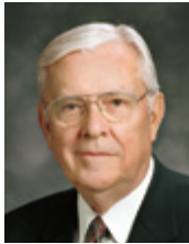
By Elder M. Russell Ballard Of the Quorum of the Twelve Apostles