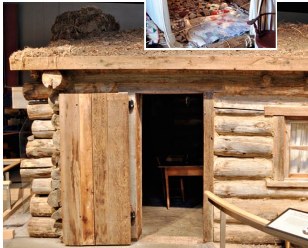
Some of the Saints built log cabins to live in while they were in Winter Quarters.