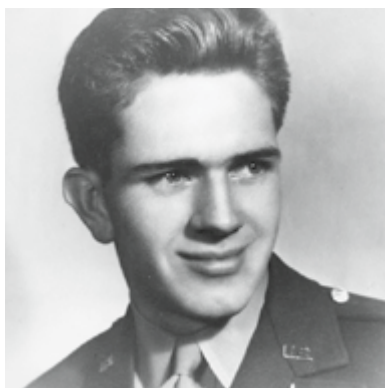
President Boyd K. Packer has been blessed for setting righteous goals.

In 2004, I accompanied President Packer and others to Japan. He had an opportunity to retrace some of his steps and reflect on some of the experiences and decisions he