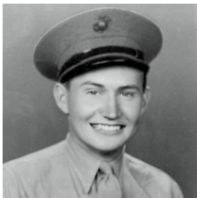
Elder L. Tom Perry acted well his part while stationed in Japan.

In our day, when being anonymous is easier than ever, there are important principles involved in not wearing a mask and in being “true to the faith . . . for which martyrs have perished.” 4