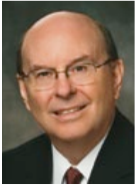
By Elder Quentin L. Cook Of the Quorum of the Twelve Apostles

P resident David O. McKay (1873–1970) often related an account that occurred while he was a missionary serving in Scotland. He was feeling homesick after being in the mission for just a short time and spent a few hours sightseeing at nearby Stirling Castle. When he and his companion returned from visiting the castle, they passed a building where the stone above the door had a carved inscription of a quotation, usually attributed to Shakespeare, that read, “What-E'er Thou Art, Act Well Thy Part.”