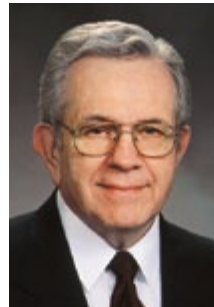
By President Boyd K. Packer

President of the Quorum of the Twelve Apostles