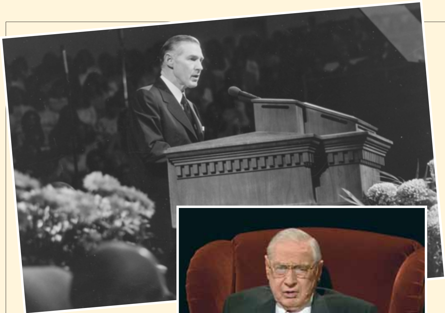
Above: A younger James Faust speaks in the Tabernacle, about 1970. Right: President Faust addresses general conference, April 2007.