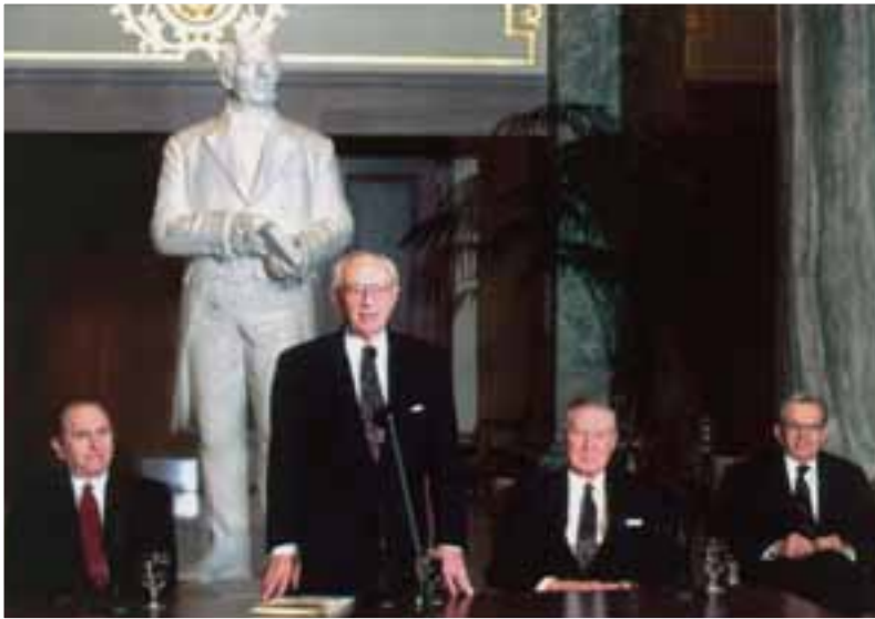
Left: At a 1995 press conference the new Church leadership is introduced: President Thomas S. Monson (left), First Counselor in the First Presidency; President Gordon B. Hinckley; President James E. Faust, Second Counselor in the First Presidency; and President Boyd K. Packer, Acting President of the Quorum of the Twelve Apostles. Below: The First Presidency at the Mount Timpanogos Utah Temple.