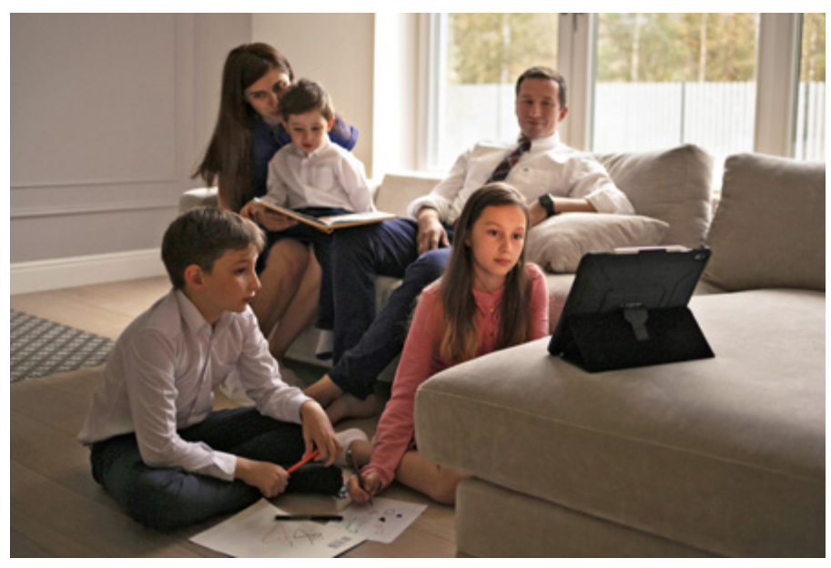
St. Petersburg, Russia

When your greatest desire is to let God prevail, to be part of Israel, so many decisions become easier. So many issues become nonissues! You know how best to groom yourself. You know what to watch and read, where to spend your time, and with whom to associate. You know what you want to accomplish. You know the kind of person you really want to become.