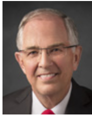
By Elder Neil L. Andersen Of the Quorum of the Twelve Apostles