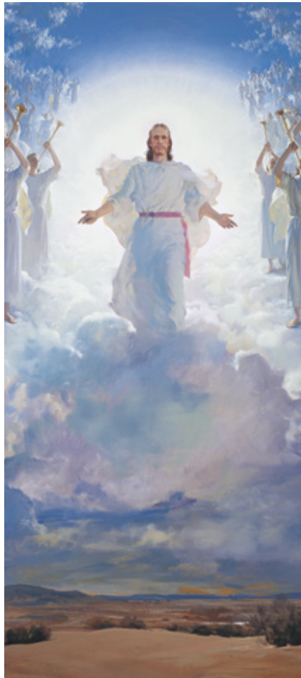
Nothing lifts my desire to speak of Christ more than visualizing His return.