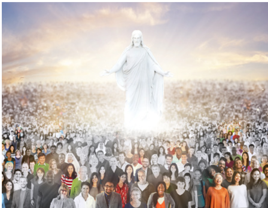
As our true colors as the Savior's disciples are revealed, many around us will be prepared to listen.

As the world speaks less of Jesus Christ, let us speak more of Him. As our true colors as His disciples are revealed, many around us will be prepared to listen. As we share the light we have received from Him, His light and His transcendent saving power will shine on those willing to open their hearts. Jesus said, “I . . . come [as] a light into the world.” 23