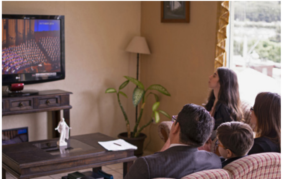
San Lucas Sacatepéquez, Guatemala

If a renewed study of the Savior helped prepare President Nelson, could it not help prepare us as well?