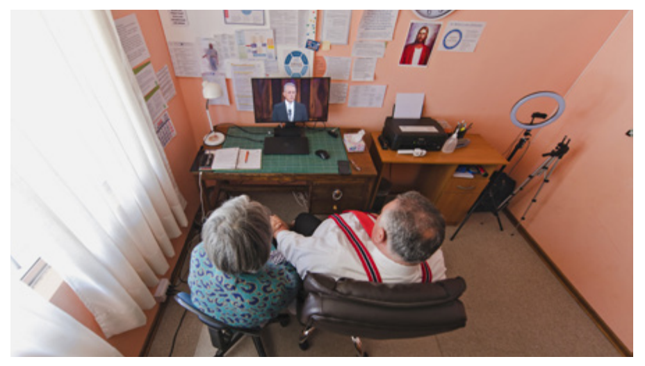
Villa Alemana, Greater Valparaíso, Chile

Seeking Christ in every thought and following Him with all our heart