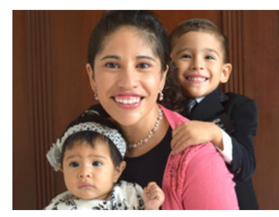
Bermejillo, Durango, Mexico

hearing the names of Deity being used casually and thoughtlessly. Coarse comments seem to have become a staple of television, movies, books, and music. Bandied about are slanderous remarks and angry rhetoric. Let us speak to others with love and respect, ever keeping our language clean and avoiding words or comments that would wound or offend. May we follow the example of the Savior, who spoke with tolerance and kindness throughout His ministry.