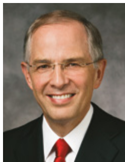
By Elder Neil L. Andersen Of the Quorum of the Twelve Apostles