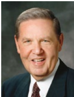
By Elder Jeffrey R. Holland Of the Quorum of the Twelve Apostles