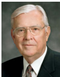
By Elder M. Russell Ballard Of the Quorum of the Twelve Apostles