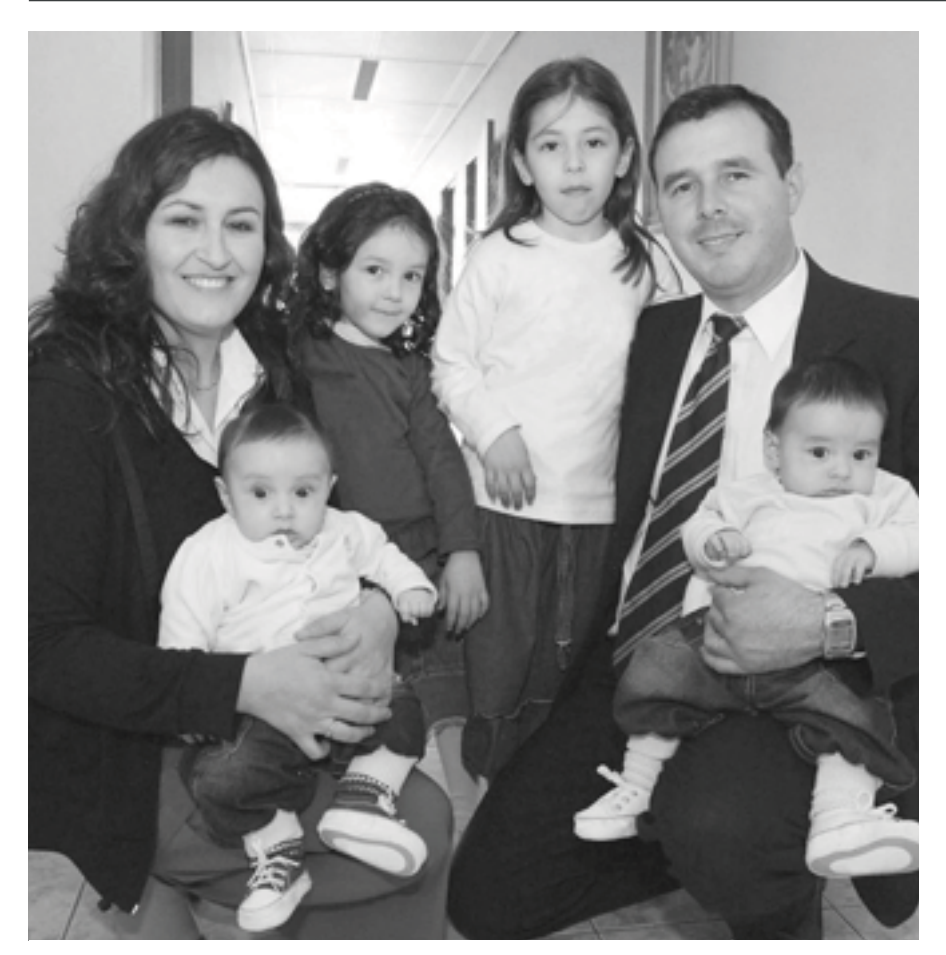
Parents in Argentina keep their children close between conference sessions.

A young single adult in our ward was dating a young woman. They allowed their affections to get out of control. He came to me for counsel and help. Based on what was