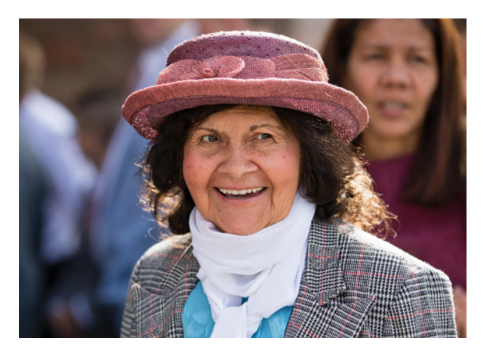
No wonder we sing:

See, the Good Shepherd is seeking, Seeking the lambs that are lost, Bringing them in with rejoicing, Saved at such infinite cost.<sup>39</sup>