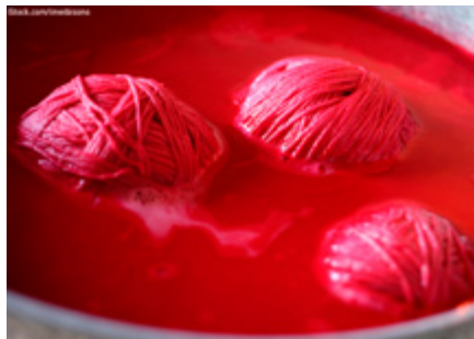
When we repent of our sins, the Savior’s scarlet blood returns us to purity.

The scarlet dye of the Old Testament was not only colorful but also color-fast, meaning that its vivid color stuck to the wool and would not fade no matter how many times it was washed. 14 Satan wields this reasoning like a club: