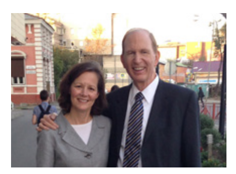
The Porters, while serving together in Russia.