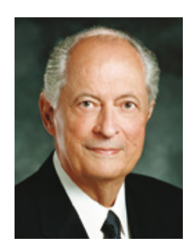
By Elder Robert D. Hales Of the Quorum of the Twelve Apostles