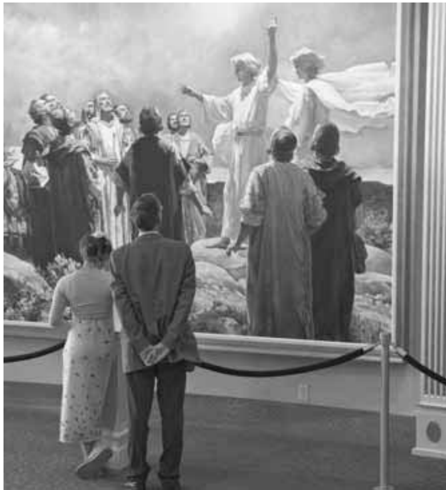
Between sessions, members look at a painting in a visitors’ center on Temple Square.

Realizing the vital role remembering is to play in our lives, what else ought we to remember? In response, assembled as we are today to remember and rededicate this historic Tabernacle, I suggest that the history of the Church of Jesus Christ and its people deserves our remembrance. The scriptures give the Church’s history high priority. In fact, much of scripture is Church history. On the very day the Church was organized, God commanded Joseph Smith, “Behold, there shall be a record kept among you.” 3 Joseph acted on this command by appointing Oliver Cowdery, the second elder in the Church and his chief assistant, as the first Church historian. We keep records to help us remember, and a record of