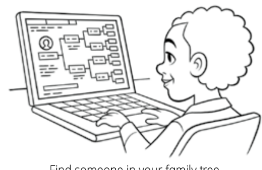
Find someone in your family tree who hasn't been baptized yet.