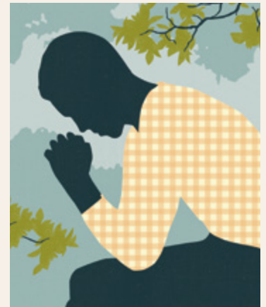
How to Share Testimony More Naturally 8