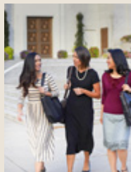
On the Cover