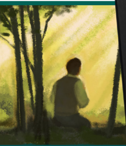
I read about the First Vision . . .