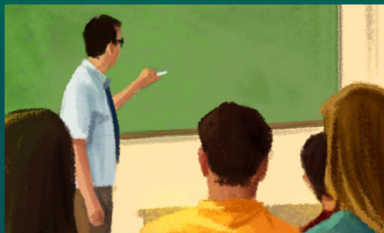
This helped me provide a good education for my children.