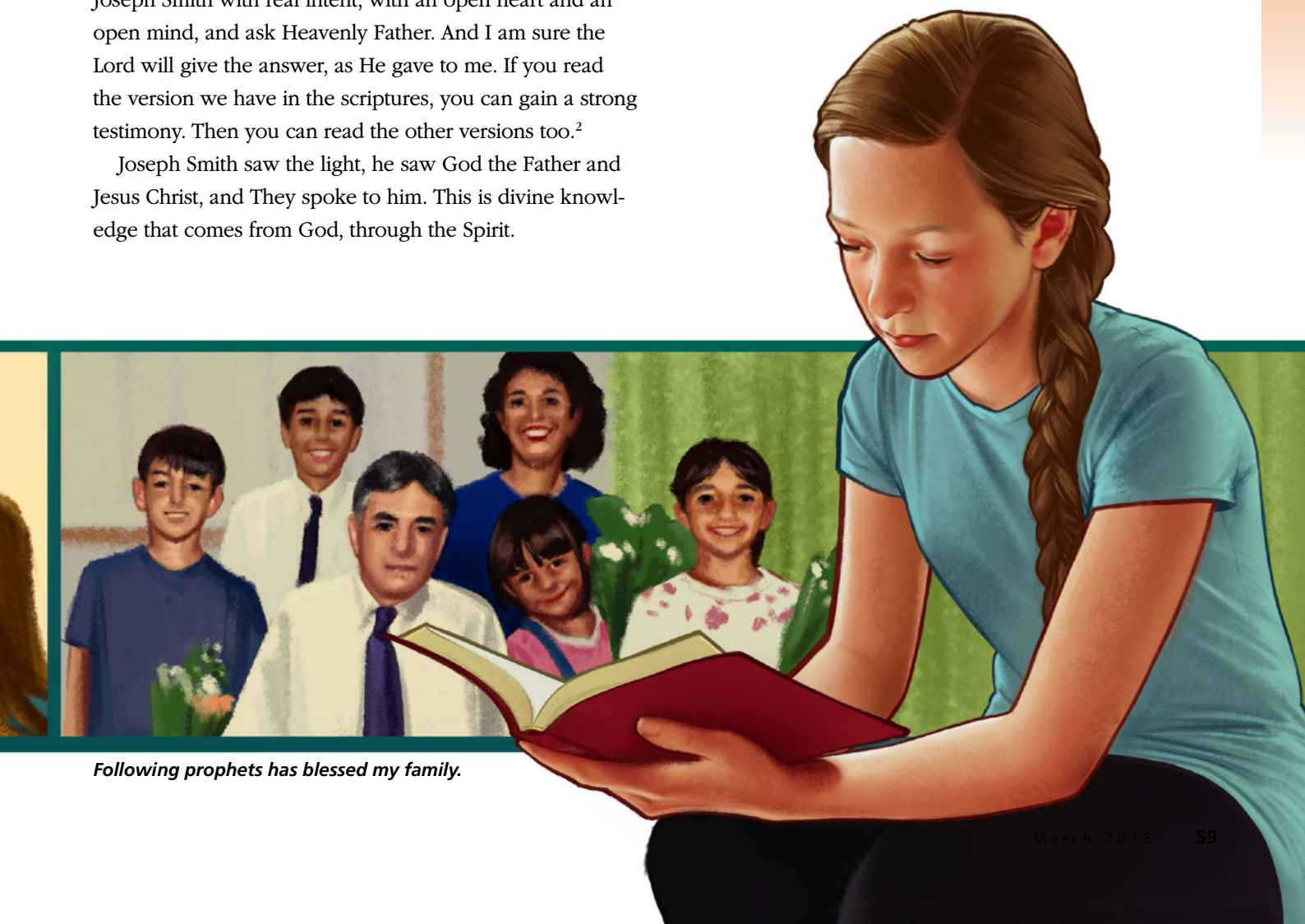
Following prophets has blessed my family.