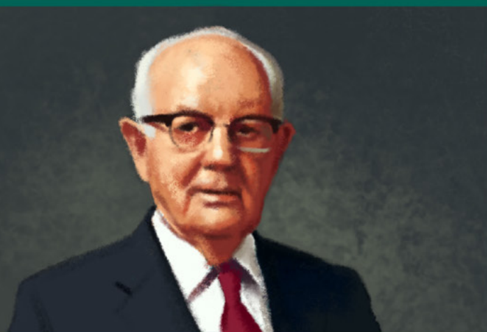
I followed the counsel of President Kimball.

After I was baptized, the first talk I heard from the prophet, President Spencer W. Kimball (1895–1985), was about being self-reliant and being wise with your money. He also said to provide a good education for your