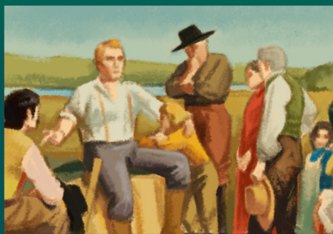
and the baptism of Joseph Smith and Oliver Cowdery and the Prophet Joseph Smith's testimony.