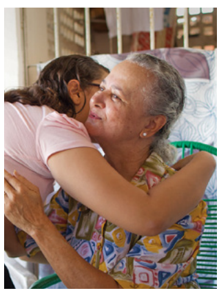
ON THE COVER