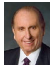
President Thomas S. Monson, “Until We Meet Again,” Ensign or Liahona , May 2013, 114.

We always speak reverently, showing respect to Heavenly Father.