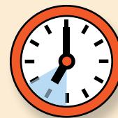
The lamps were lit at dusk.

A wick made of flax fibers or a rush stem was placed in the spout, and then the lamp was filled with olive oil. Once the wick absorbed the oil, the lamp was lit.