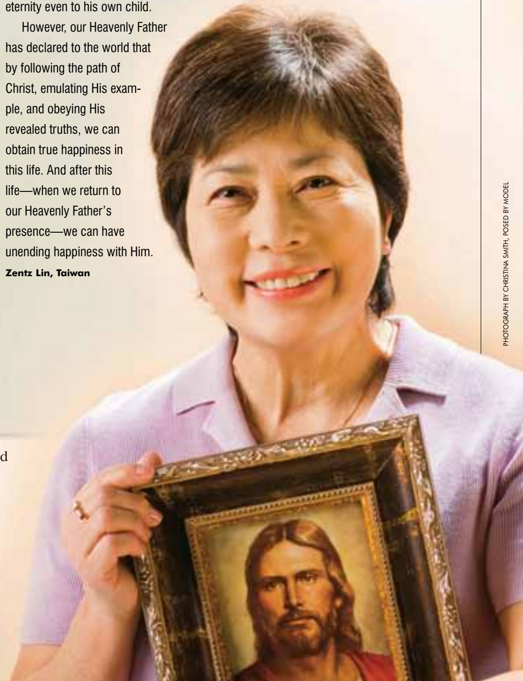
POSED BY MODEL