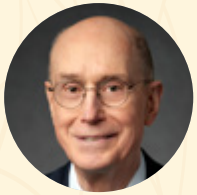
By President Henry B. Eyring Second Counselor in the First Presidency