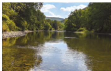
The Susquehanna River at Harmony, Pennsylvania, near where Joseph Smith and Oliver Cowdery were baptized on May 15, 1829.