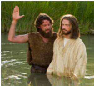
Bible video depiction of John the Baptist baptizing Jesus Christ.

Oliver Cowdery, in Joseph Smith—History 1:71, note; emphasis added