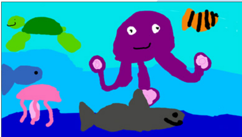
Philip W., age 8, Lancashire, England