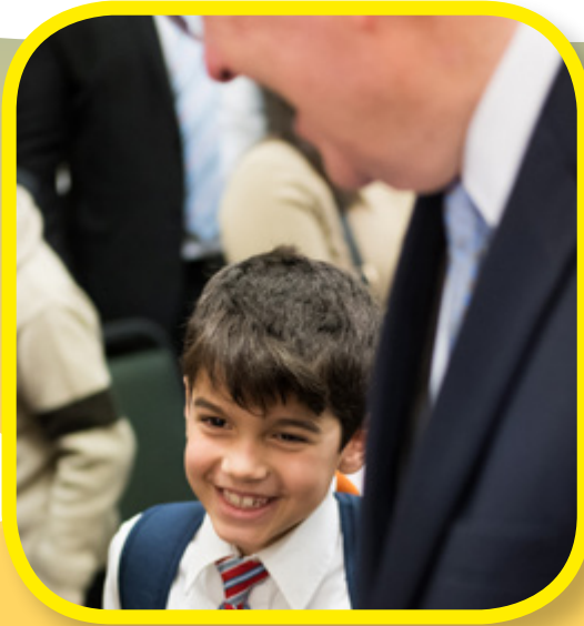
Children were very happy to meet an Apostle of God!