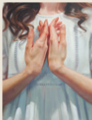
On the Cover The Release, by Jenedy Paige.