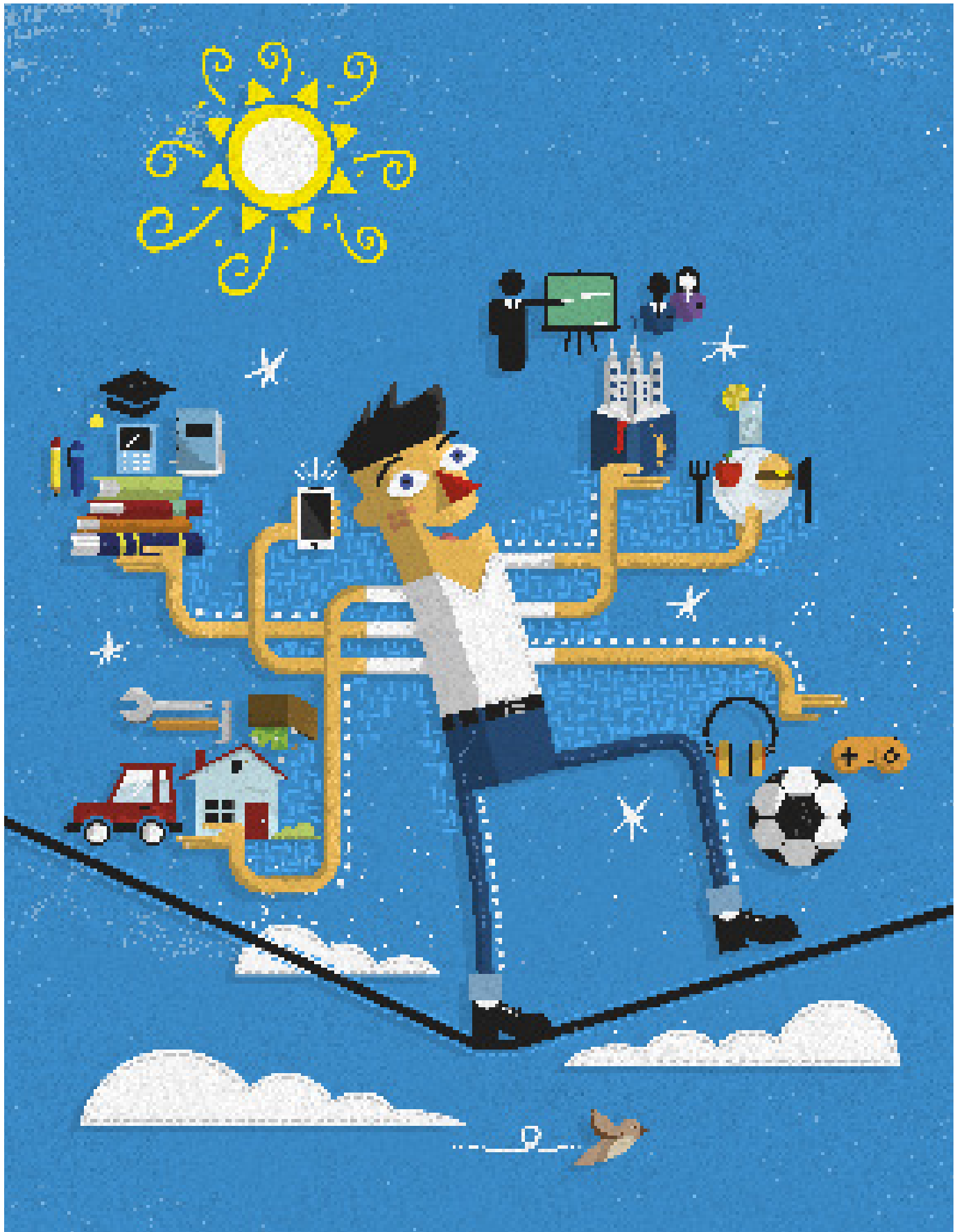
ILLUSTRATIONS BY DAVID GREEN