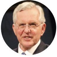
By Elder D. Todd Christofferson