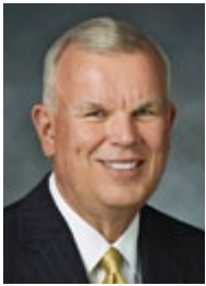
By Elder Steven E. Snow Church Historian and Member of the Seventy

The overwhelming evidence of Church history is positive and faith-promoting. In its full context, it is absolutely inspiring.