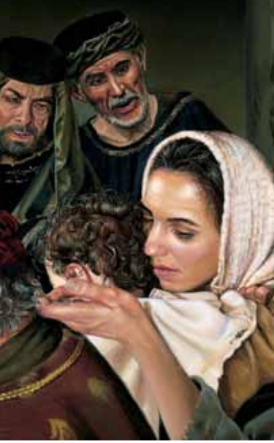
© LIZ LEMON SWINDLE, FOUNDATION ARTS, MAY NOT BE COPIED