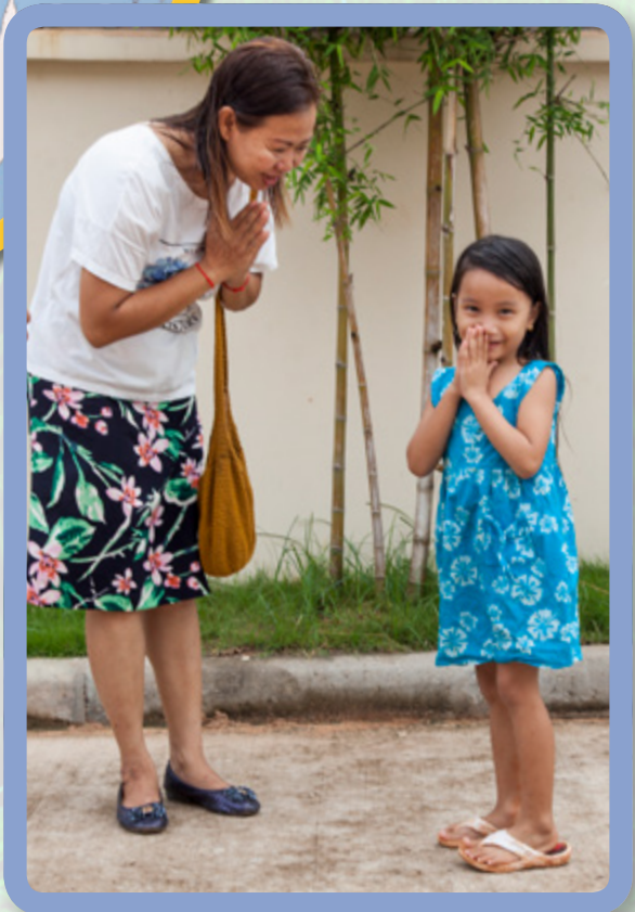
PHOTOGRAPH OF MEMBERS GREETING EACH OTHER AND MAN ON THE MOTORCYCLE BY JAMES ILLIFF JEFFERY

These Church members are greeting each other in the traditional Cambodian way, called sampeah . The higher your hands are, the more respect you show.