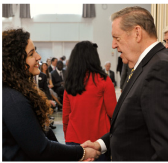
Elder Holland in England