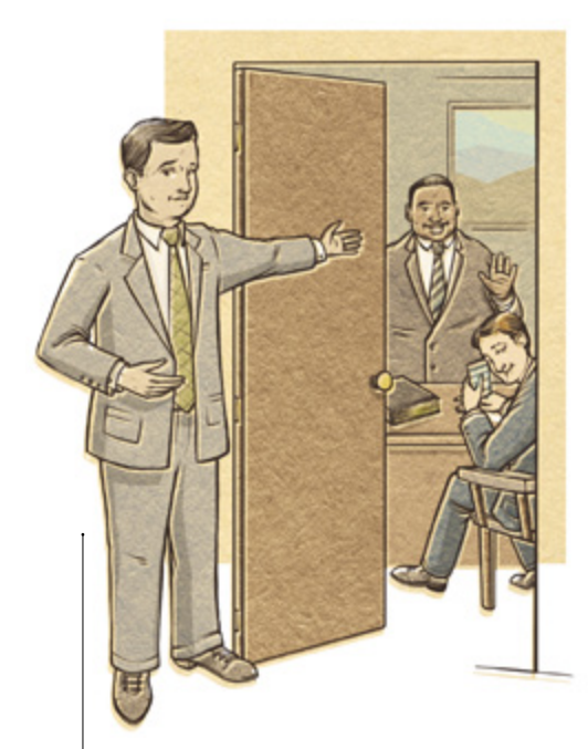
The bishop and his two counselors form the bishopric and preside over the ward.