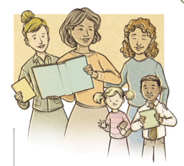
The Primary presidency serves the children, and the Young Men and Young Women presidencies serve the youth ages 12–18.