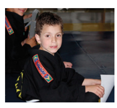
I love to play football. Another sport I like is hapkido, a kind of martial art from Korea.

When I grow up, I would like to be a missionary. I want to serve in Manaus because it's where the Amazon forest is. Then I want to work as an art designer.