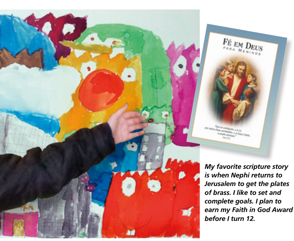
I like to draw. I spend many hours every week on my artwork. I also like to visit the library and look at the art books.