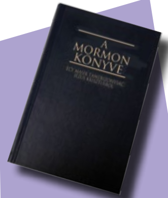
The Book of Mormon was published in Hungarian in 1991.