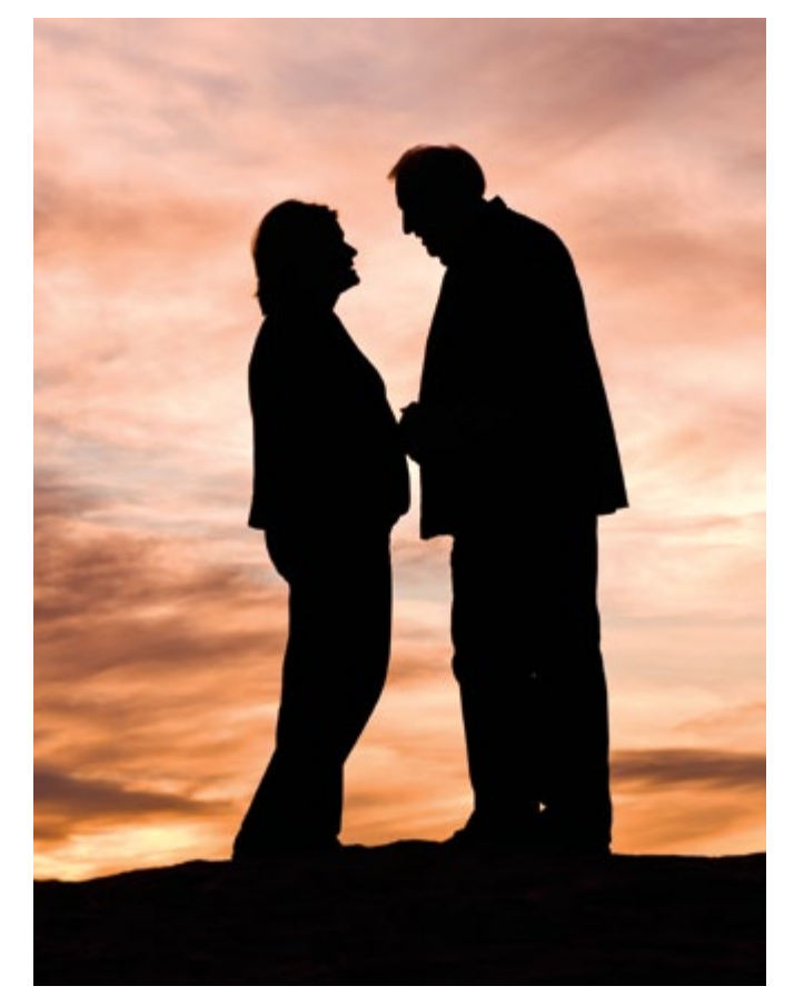
Great happiness has come into our lives because we are united in the gospel.

What made the difference in me? The Holy Spirit and a knowledge of the scriptures. Both gave me the courage to change my life and to ask God for forgiveness of my sins, which were what had really kept me from joining the Church all those years.