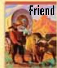
THE FRIEND COVER