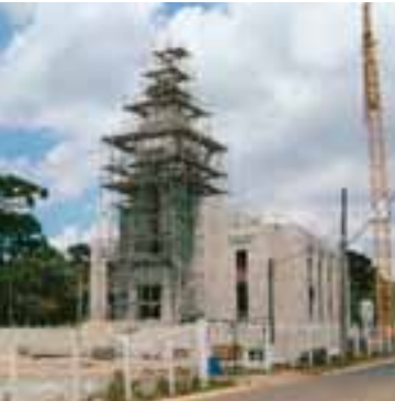
18 This, the Greatest of All Dispensations